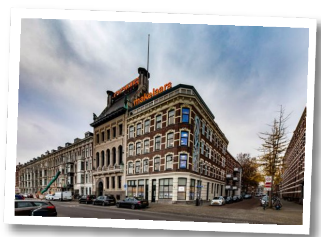
Maaskade 113, 3071 NJ Rotterdam

Informatie aanvragen of bezichtiging plannen? Bel: 010 - 424 8 888